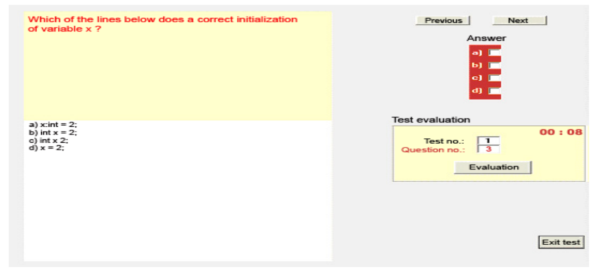
Fig.2. Test Example

The fig. 2 shows an example for testing which used the Eval Module: